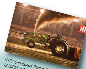
NTPA Sanctioned Tractor Pulls on the Pulling Track 12:30PM and 6:30PM