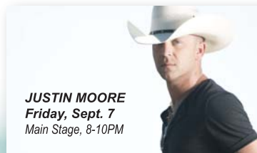
JUSTIN MOORE Friday, Sept. 7 Main Stage, 8-10PM