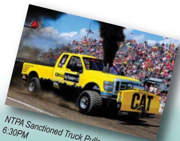
NTPA Sanctioned Truck Pulls on the Pulling Track 6:30PM