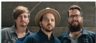
CARROLLTON on the Main Stage 7-9PM